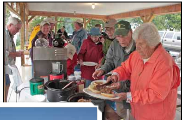
Pulled pork pot luck supper on Saturday.