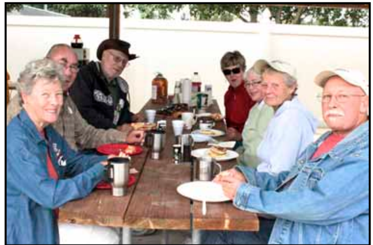
Breakfast on Saturday